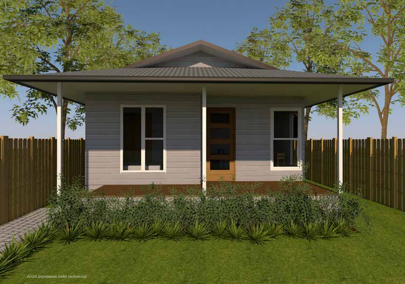
Artist impression (refer inclusions)