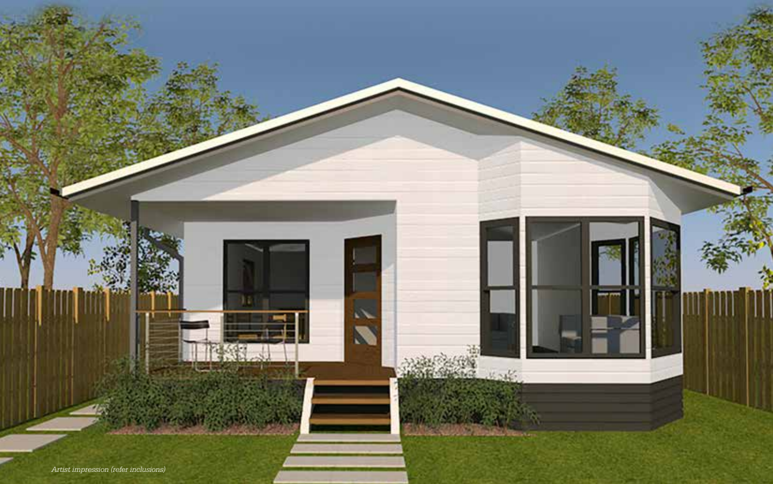
Artist impression (refer inclusions)