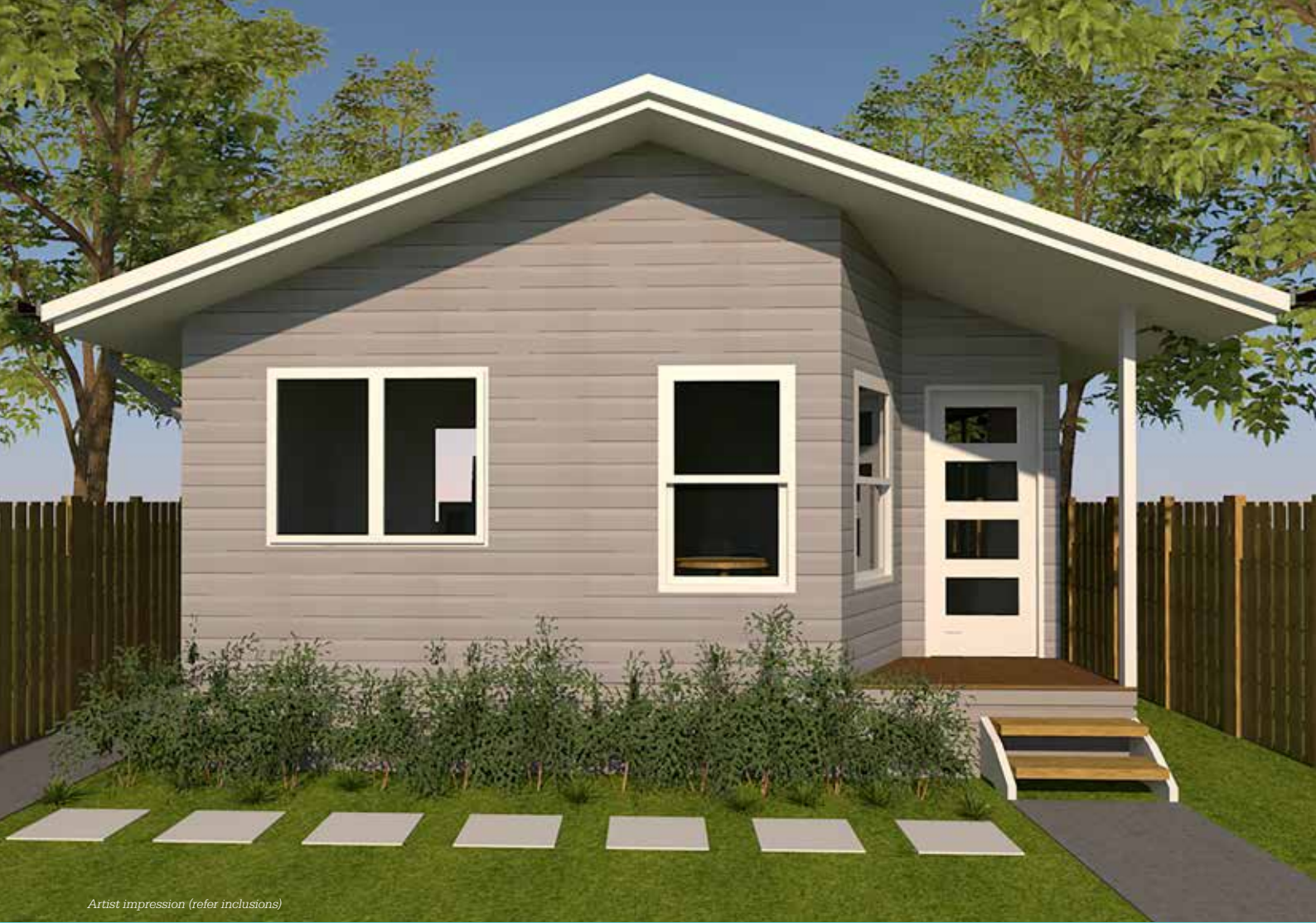
Artist impression (refer inclusions)