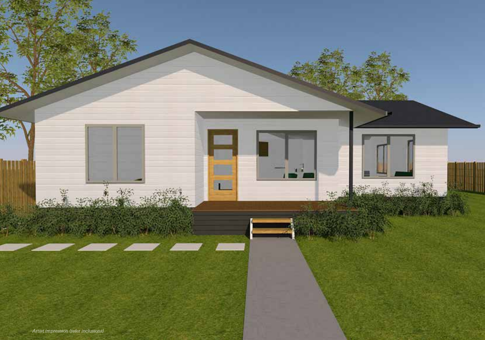
Artist impression (refer inclusions)